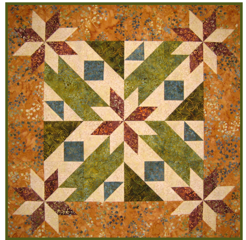
designed by Annis Clapp

The block units are pieced oversized then squared to the exact size for easy assembly. Four of the star units make a Floating LeMoyne Star.